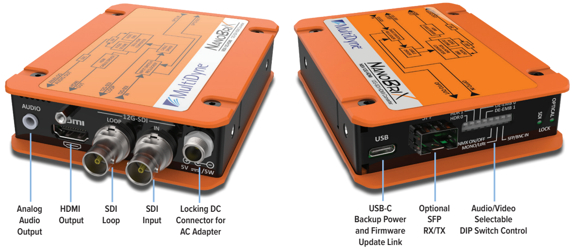
Analog Audio Output HDMI Output SDI Loop SDI Input Locking DC Connector for AC Adapter